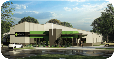
SOUTHWEST PROPOSED BUILDING

decided to make commitments and contributions, there have been over $780,000 worth of contributions and we exceeded our 50% goal of $500,000 in less than 4 months!