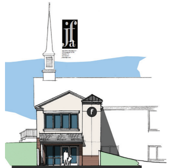
FCC NORTH PHASE II ADDITION