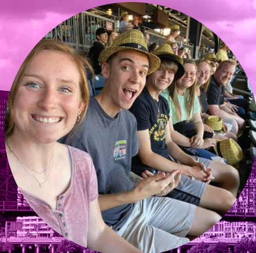
Travelers Church Pittsburgh, PA