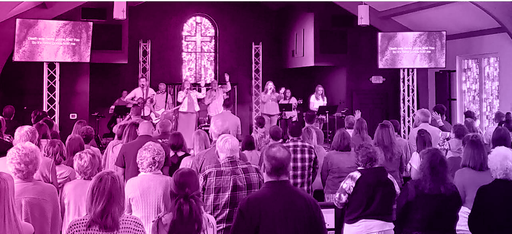
2022 Easter North Campus Launch